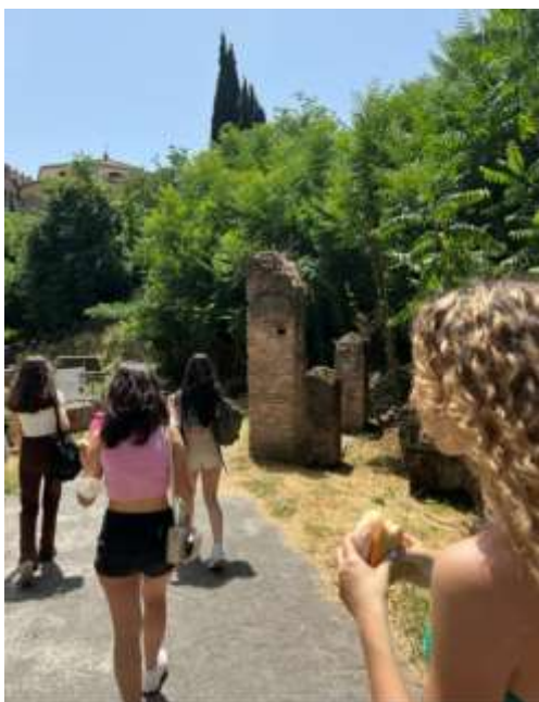
Rome, 3 June 2022 at school in the afternoon

We all hope that they will spend good days in Rome with the TRAME project and that they will never feel like strangers in our city!